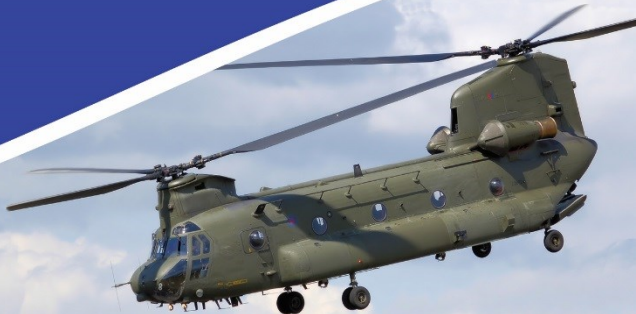
Pictured: Boeing CH-47 Chinook

The AHR150A ADAHRS (Air Data Attitude Heading Reference System) from Archangel Systems represents a paradigm shift in the ADAHRS market. Using MEMS sensors and sophisticated blending algorithms, the ADAHRS yields “FOG-grade” performance at greatly reduced size, weight, power, and cost.